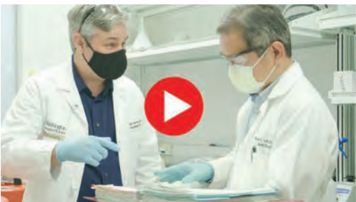
Siteman & Siteman Kids Researchers

Meet our 2024 Featured Fighters. They are members of the Pedal family – survivors, fighters, doctors, researchers and caregivers – for whom the fight with cancer is personal. Together, we can create a world without cancer – all cancers, for everyone.