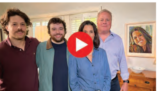
The Drier Family