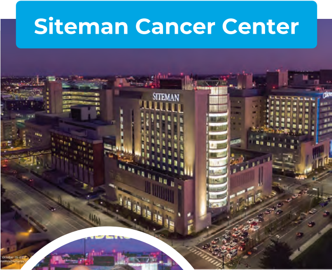
Siteman Cancer Center

The Bill and Amy Koman Founders Award annually recognizes individuals and organizations who share their passion, vision, and generosity, and who have been instrumental in establishing and growing Pedal the Cause.